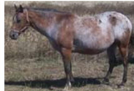
Nnamtrah Miss Chevy