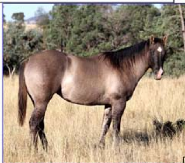
CAYUSE SCRATCH ME FIRST MARE IN FOAL TO LORIS FLASHPOINT AF LYN,EARLY FOAL.