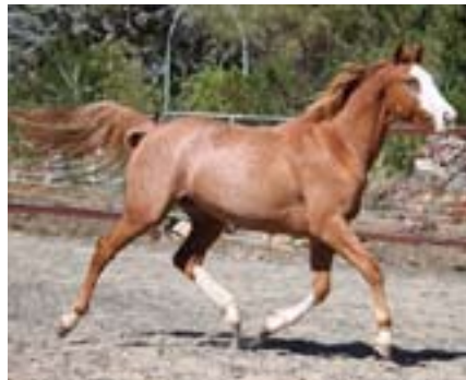
Cayuse Grand Opera