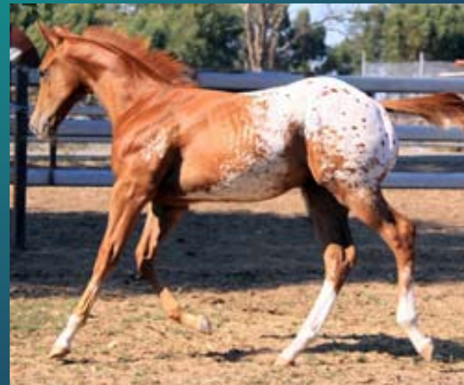
CA Entourage - colt by Something Jazzy from First Audition - winner of the 2009 Sportaloosa Video Foal Futurity