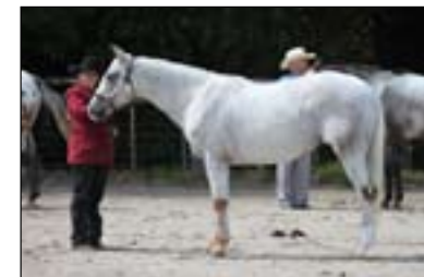
Legs: You can only see 2½ legs!!!