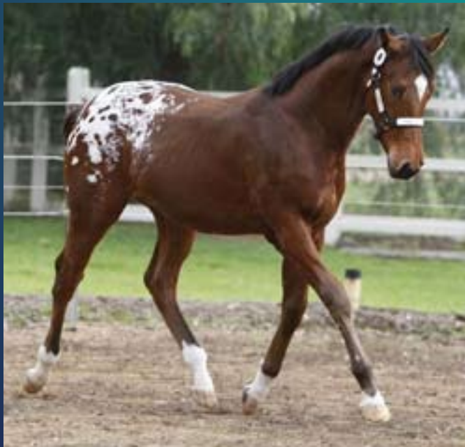
CA Encore - colt by Something Jazzy from First Audition

Shipped semen preferred, frozen also may be available.