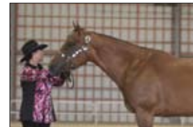
Forward Ears: Same horse, but ears forward, makes for a much nicer photo! Again, patience prevailed!