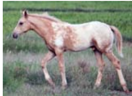
Cayuse Chat On Sunday