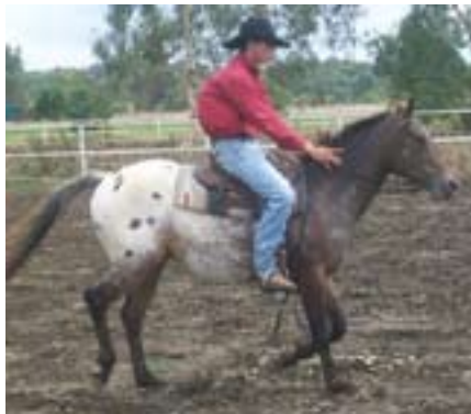
Nnamtrah Chevy's Prince