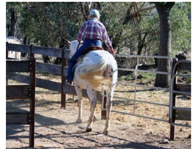
Stepping over to shut