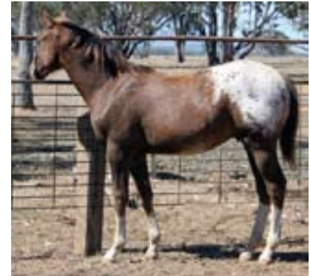
Cayuse Hello Pepto