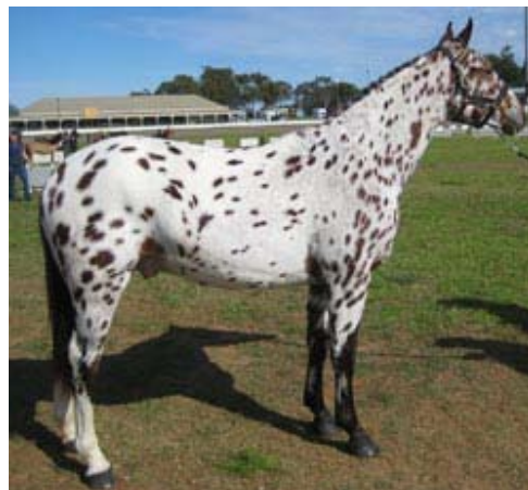
Cayuse Edward X

To top it all off, Little Miss Leuwin shown