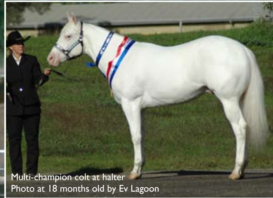
Multi-champion colt at halter Photo at 18 months old by Ev Lagoon

National, State and Futurity Champion R.O.M. Reining R.O.M. Trail R.O.M. General Performance