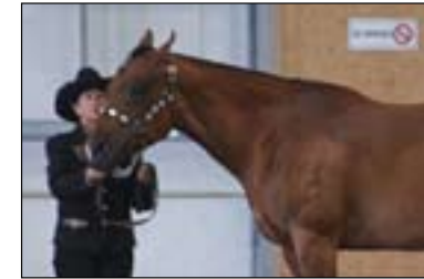
Angry Ears: You will get a horse every now and then who refuses to put ears forward! As you can see it doesn't make a nice photo