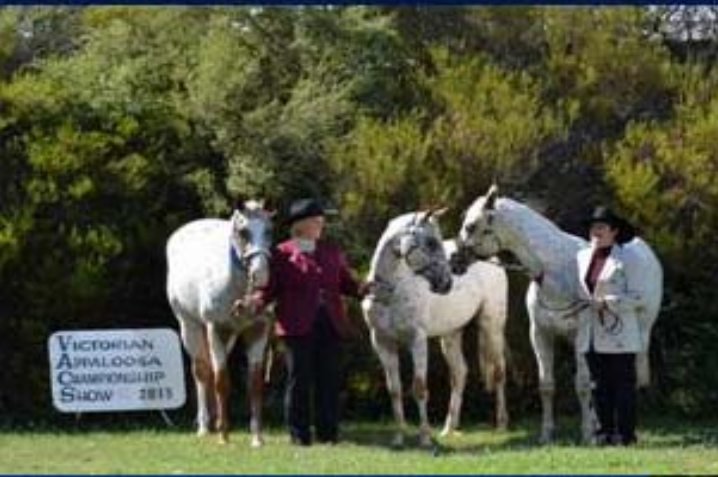
2011 State Champion VACS Get of Sire