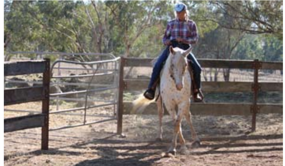
Sidepassing to the gate

These four different ways can be asked from either the left or right hand so you can see you need all the basic maneuvers then it's just a matter of putting it all together at the show.