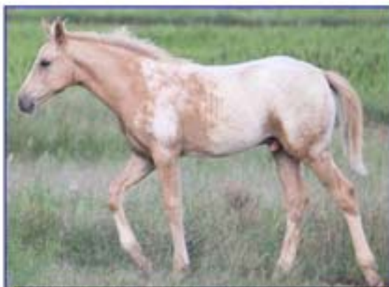
CAYUSE CHAT ON SUNDAY,WEANLING COLT