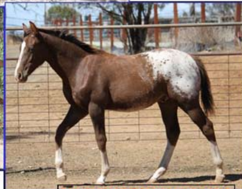
CAYUSE HELLO PEPTO,WEANLING COLT

ALL ENQUIRIES WELCOME,PHONE:0267433533,E-MAIL:SPORTALOOSA@BIGPOND.COM OR CHECK WEBSITE.