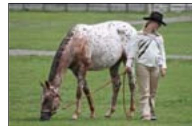
Relaxed Shots: When people don't know your taking photos they can sometimes be the best shots of the day...