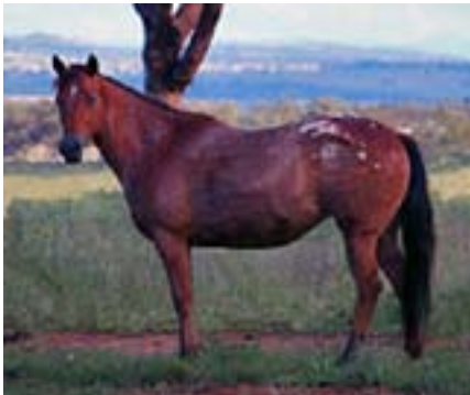
Cayuse Stylish Few