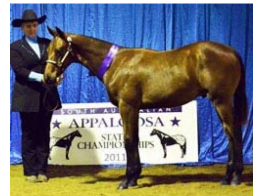
Kerrinna Haven A Katnap