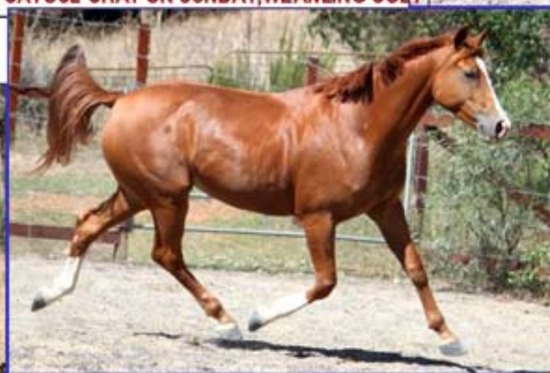
CAYUSE MONIKAS MAJIK,OWN DAUGHTER OF ROTSPON SUCCESSFUL DRESSAGE MARE,STATE CHAMPION.