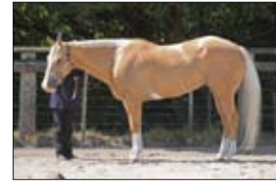
Correct Angle: shows horses rump as true

Tip #4: Handler... once you get everything above right, tell the person to look at you. Quite often you will get the perfect shot, and the person is either looking off in a different direction, or still trying to fiddle with the horse, or worse yet talking! Don't be afraid to tell them to shut up (should be easy if your friends!) because every time they talk, the horses ear's will turn towards their voice (this also is a good tip when they are on the horse). Tell them to be quiet, look at you, smile, and you can take the photo as soon as those ears flick forward.