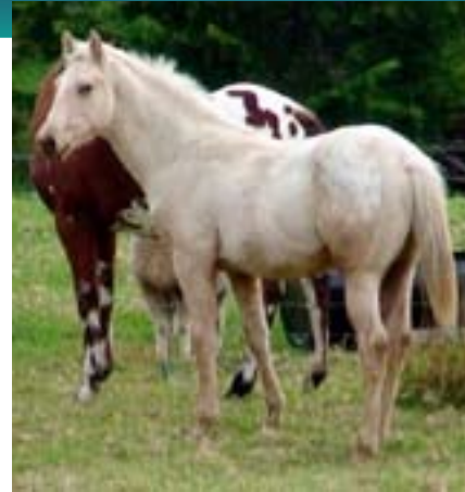
GAB's Made To Order