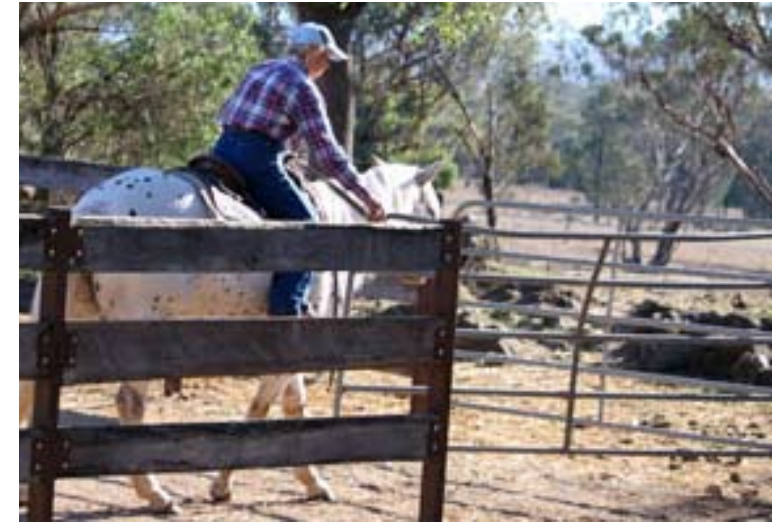
Pivoting around forehand