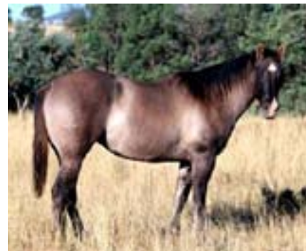
Cayuse Scratch Me First