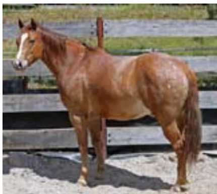
Cayuse Slow Lopin Joe