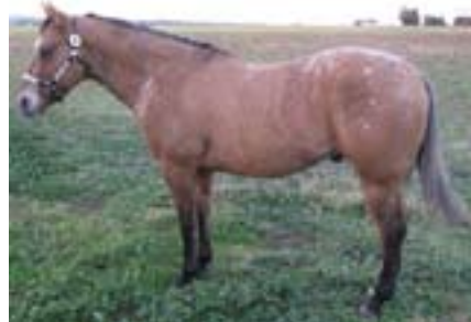
Service to Yallawa Bound For Stardom