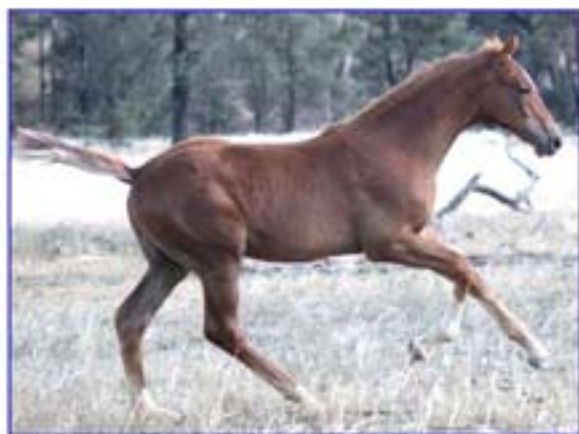
CAYUSE WARRIGAL,HUGE WEANLING GELDING.