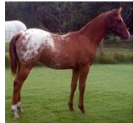
Little Miss Behavin