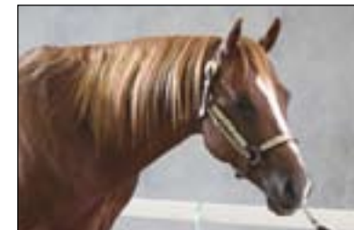
Head Angle: You can see the whole forehead as well as other eye and both ears. This is also a great 'jandel' shot as you can see the... ...the... ...the...