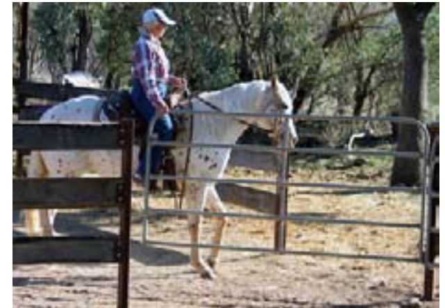
Starting to turn with gate