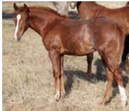
Cayuse Mycats Myhat