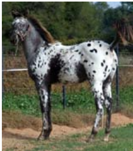
CA Hail Confewsious