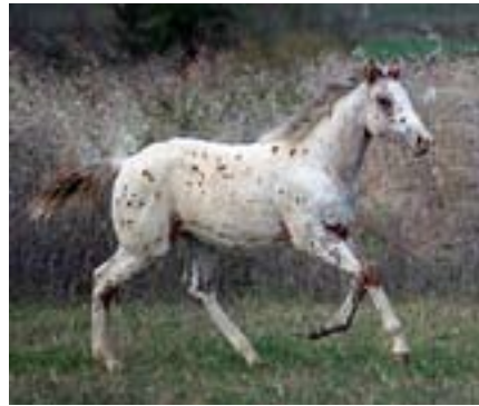
Nnamtrah Fine And Dandy