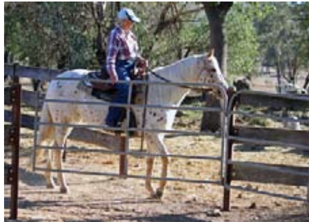
Back through push away sequence

If there are pot plants on the trail course be careful you don't knock them over or worse still your horse thinks they are a free feed and goes to eat one!