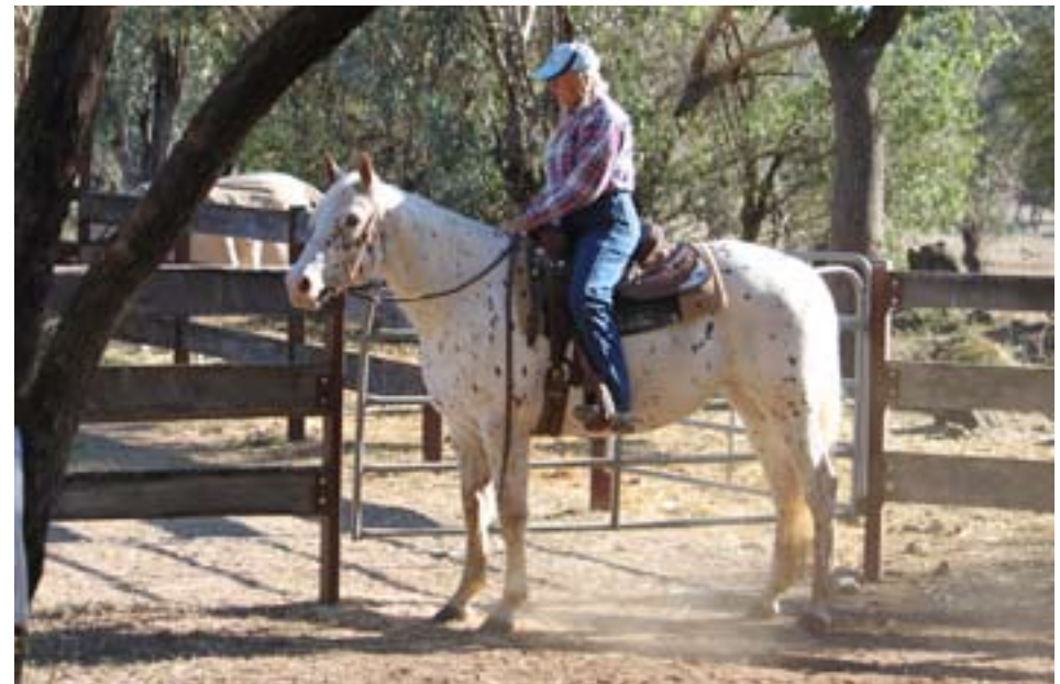
Facing latch end for the pull/push away and ride through gate. To start the rider would have latch opposite leg.