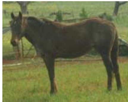
Nnamtrah Chevy's Gift