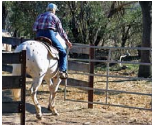
Turning on forehand