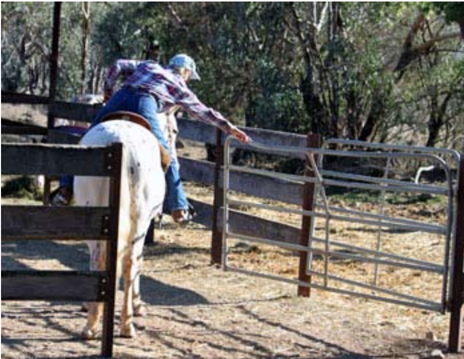
Losing control of the gate as gate opened too wide and horse didn't stay close enough.

By doing this it helps to put all the parts together smoothly and pleasing to the judges eye!