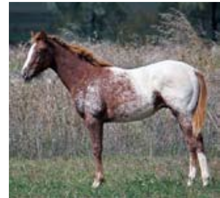
Nnamtrah Snow Scout