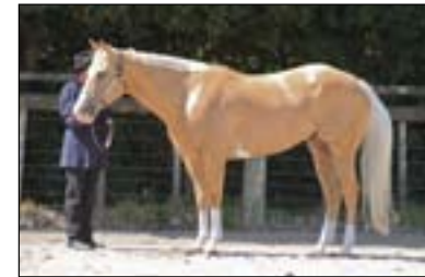
Incorrect Angle: shows horses rump as weak