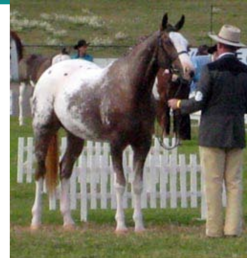
Little Miss Leuwin