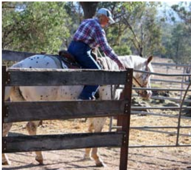
Stepping over to shut