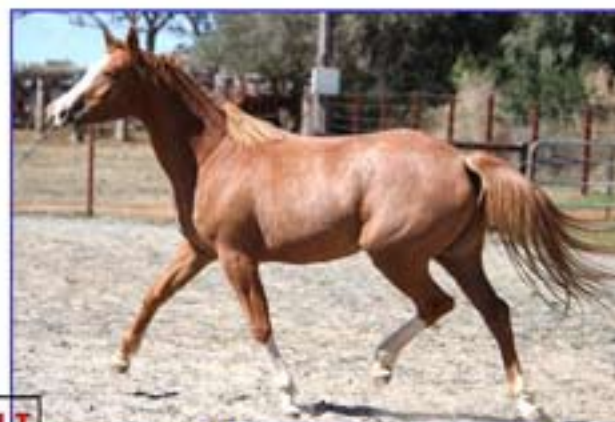
CAYUSE GRAND OPERA 2 YEAR OLD FILLY.