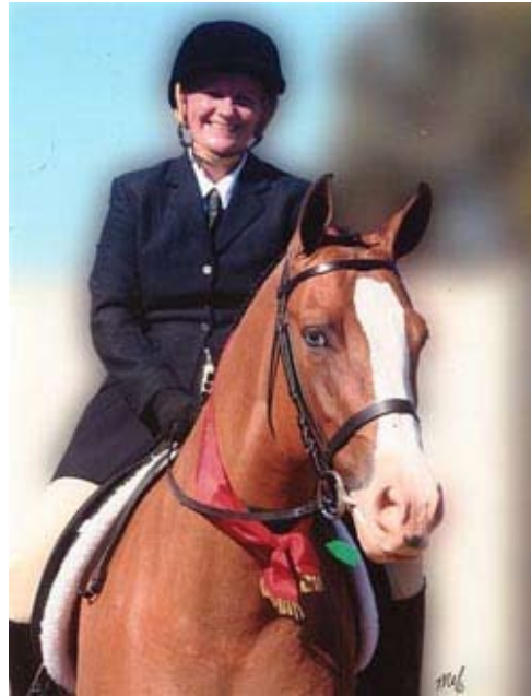
El Dorado L'il Miss Henry