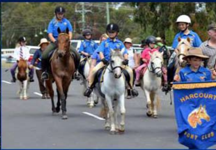
Oregon Park Justin Affair , 2yo bay roan gelding, Harcourt Applefest Street Parade

Oregon Park Appaloosas Ev & Mat Lagoon 590 Stratton Road Echuca West KOOLKARS@bigpond.com Phone 0408 834 911