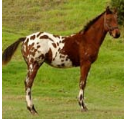
GAB's Tailor Made